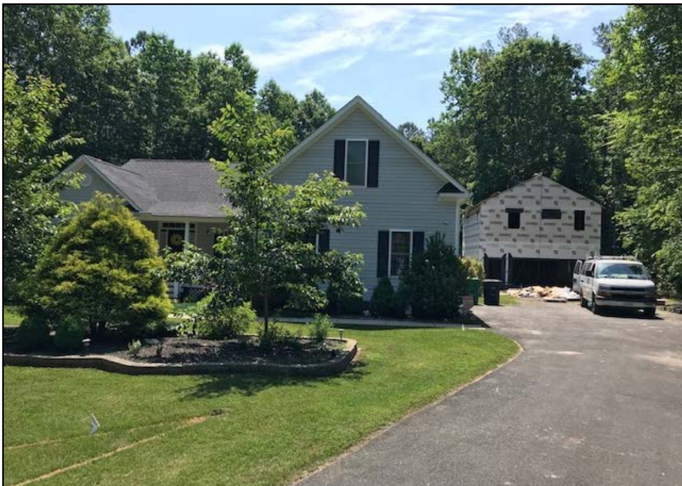
Figure 3: Existing Single Family Dwelling and Garage Under Construction at 6400 Ivory Bill Ct.

The conditions recommended for this proposal limit the occupancy to the occupants of the principal dwelling and individuals related to them ( Condition 1 ). Additionally, a deed restriction recorded against the property provides for the limitation of the use permit ( Condition 2 ). As conditioned, the use should not adversely affect area residential uses.