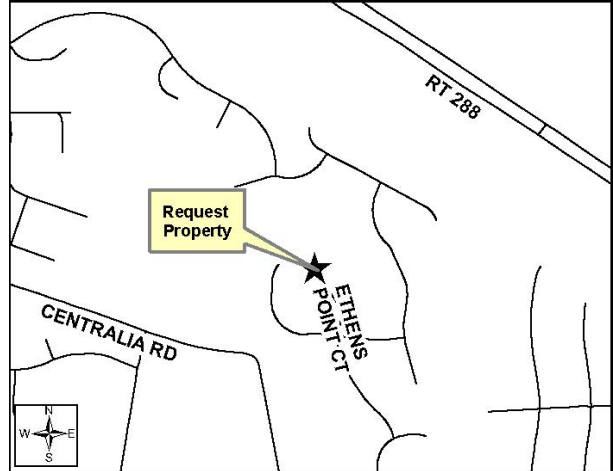
0.5 Acre – 10600 Ethens Point Court