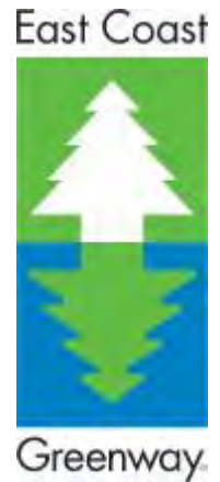
East Coast Greenway Woodpecker Road Multi-Use Path

Chesterfield County received their first East Coast Greenway designation January 5, 2019. The Board of Trustees and Greenway Council of the East Coast Greenway Alliance recognized the Woodpecker Road Multi-Use Path as part of the East Coast Greenway. East Coast Greenway trail markers will be placed by Chesterfield County Parks and Recreation. Additional portions of the East Coast Greenway are being considered throughout the county. Visit the East Coast Greenway website ( www.greenway.org ) for more information about this multistate trail.