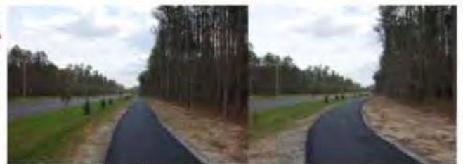
Completed 0.5 Mile Lake Margaret Home Owners Association Trail